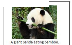
A giant panda eating bamboo.