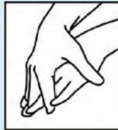
The back of the hands