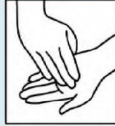
The tips of the fingers